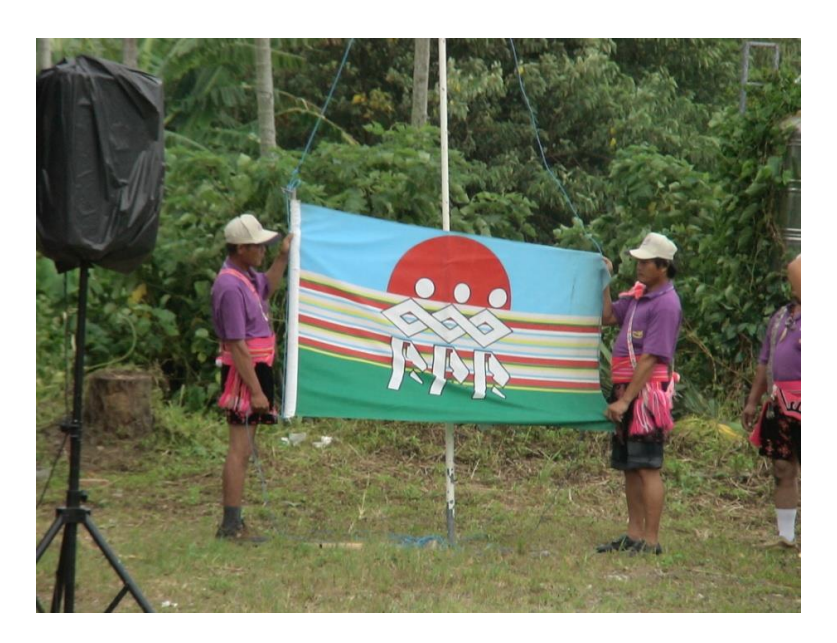
Fig. 6 The Flag of the Amis during a ritual

three key figures from the genesis narrative, Paong, Tenged, and Calaw, who established Amis social and cultural foundations, have been set (Fig. 6). The flag, song, and rituals have all been included in the opening and closing ceremonies of baseball games played by the Amis. These features have also been incorporated into traditional indigenous social organizations since the late 1990s, when the government converted them into officially-monitored corporations.