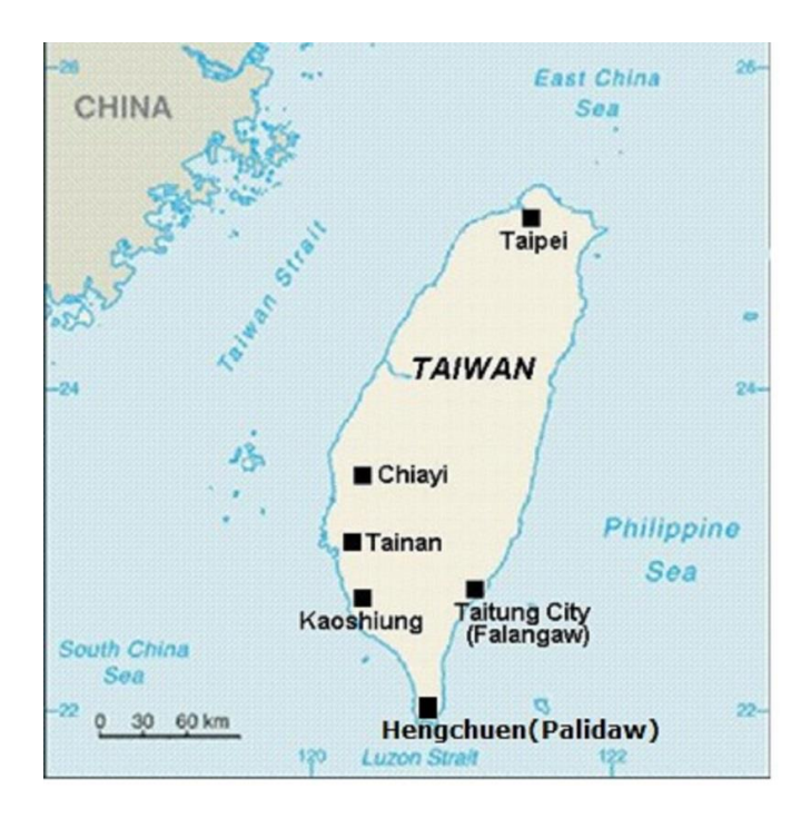
Fig. 2 Map of Taiwan

Traditionally most Falangaw Amis people were farmers and fishermen growing rice and fishing for subsistence. The term the Amis people use for community is niyaro ', which means a social space within the confine of rail fences. The boundary between themselves and outsiders was obvious.