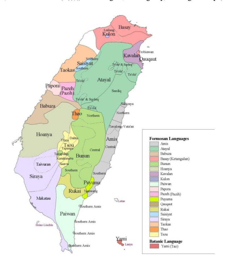
Fig. 1 Map of Formosan and Yami Languages. Adapted from Tsuchida (2009).

The Amis, an Austronesian speaking indigenous people or "Tribe," live in Taitung City, eastern Taiwan (Fig. 1 and 2).1 The Falangaw Amis, one of the biggest Amis communities, reside in Malan (馬蘭) or Falangaw, Taitung city, Taitung County (Fig. 2).