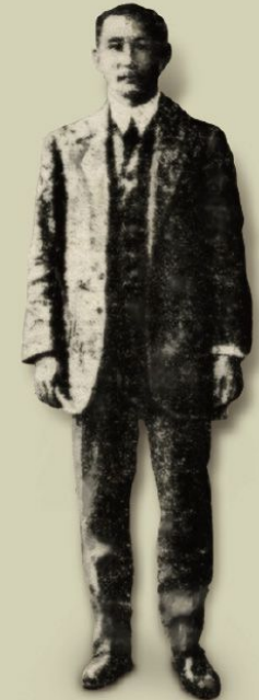
Sun Yat-sen Photographed on the Deck of the Shinano Maru

Forming Sun Yat-sen's image as a "spiritual leader" and its far-reaching influence on Taiwan is this reconstruction of the revolutionary image in the ideals advocated by Sun Yat-sen that have led Taiwan on the road to freedom and peace.