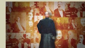
Digital Video of "The Influence of Revolutionaries on Taiwan"

Revolutionary leaders who influenced Taiwan are brought to life through digital video.