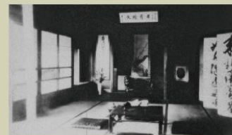
The Umeyashiki Hotel