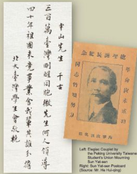
Left: Engraving Copied by the Peking University Taiwanese Student's Union Mourning Sun Yat-sen Right: Sun Yat-sen Postcard

Not only displaying historical information and relics of Sun Yat-sen, but also various modern souvenirs made in Taiwan to commemorate Sun Yat-sen.