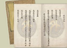
The Treaty of Shimonoseki

Precious historical relics reconstructing the Mudan Incident and the Treaty of Shimonoseki, which led to Japan's 1874 invasion of Taiwan.