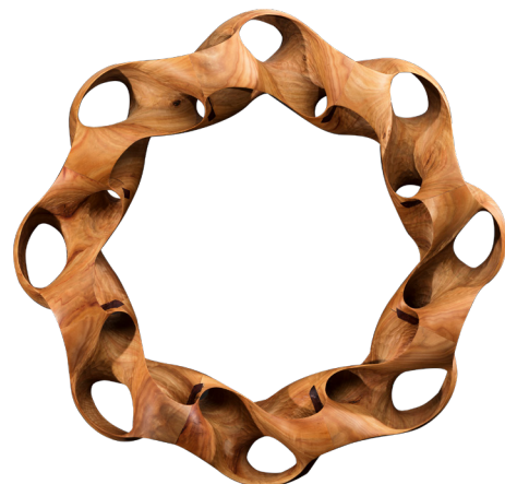
臺灣 Taiwan 游宗穆 Zong-Mu YOU

貝殼·旋二十一 Shell · Spin 21 木 Wood 125X125X25cm