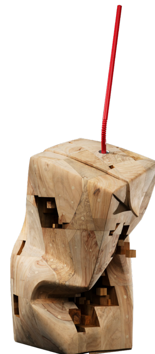
臺灣 Taiwan 林志航 Chih-Hang LIN

壓扁 ing 22 Squashing 22 樟木集成材 Camphor Glulam 79X69X160cm