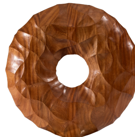
保加利亞 Bulgaria 莉莉亞·波玻妮可娃 Liliya Pobornikova