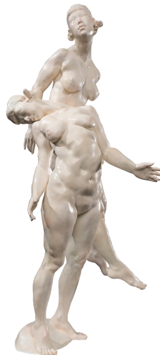
臺灣 Taiwan 林建廷 Chien-Ting LIN

伴生種 Companion Pieces 石膏纖維 Plaster 60X70X120cm