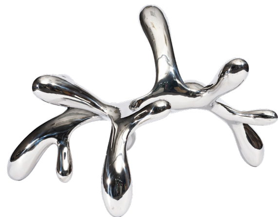
西班牙 Spain 南多·阿爾瓦雷斯 Nando Alvarez

水舞 Water Dance 不鏽鋼 Stainless steel 104X65X72cm