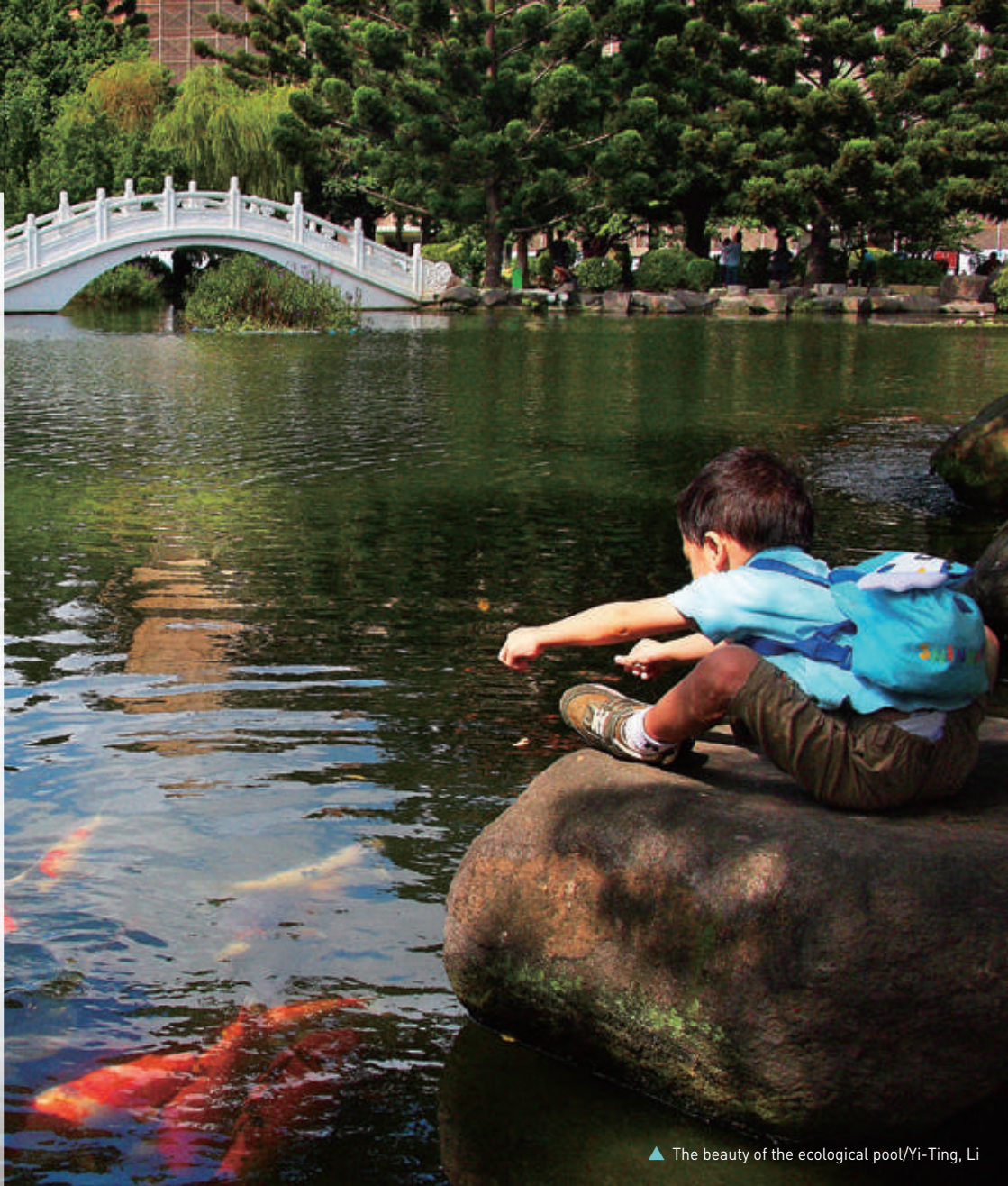
▲ The beauty of the ecological pool/Yi-Ting, Li

The park covers 25 hectares, with lush grassy areas and luxuriant trees and flowers, providing ever-changing charms throughout the seasons. There is a variety of garden landscaping, ponds, and bird, fish, and insect eco-abundance in the park, making it a fine place for the public to come play Chinese chess, exercise, and stroll, getting close to nature and enjoying cultural sightseeing.