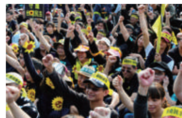
▲ Sunflower Student Movement in 2014/ Wan-Xing, Qiu