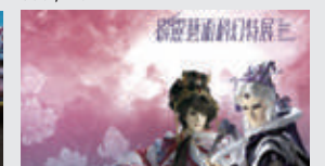
▲ "Pili" special exhibition/Pili Co., Ltd.