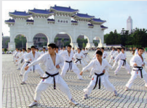
▲ Liberty Square/Yu-Shan, Xu