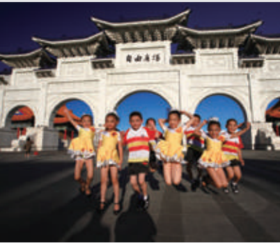
▲ Cheerfulness/Yan-Huang, Shen