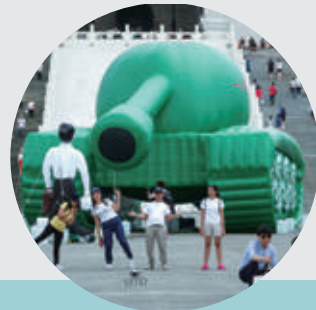
▲ 30th anniversary of "1989 Tiananmen Square protests" special exhibition/Zi-Ming, Huang

As an important historical venue for witnessing the democratic development of Taiwan, the CKSMH has actively organized exhibitions to advance reflection and speculation concerning human rights, for example "Daylight Breaking: A Retrospective of Taiwan's Democratic Developments, 1987-1996," "Return to the Square: Special Exhibition for the 30th anniversary of the 1989 Tiananmen Square Massacre," "Awakening Tide: The Call for Freedom on the Long Road to Democracy," etc., continually promoting the universal values of liberal democracy and human rights.