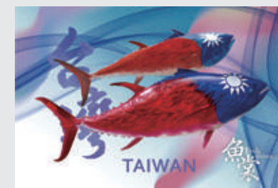
▲ Fishwear-vibrant ocean art/Taiwan Ocean Artistic Museum