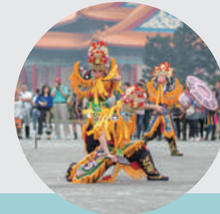
▲ Chinese New Year artistic performance