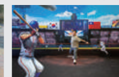
▲ Taiwan 3D Art/CKSMH