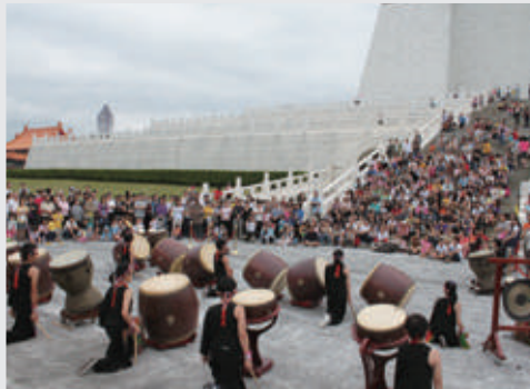
▲ Joyful October/Taipei Municipal Lao-Song