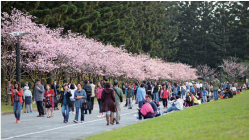
▲ Japanese cherry blossoms in full bloom