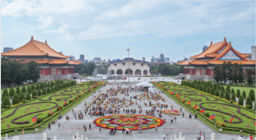
▲ Flower carpet display promotional activity/CKSMH