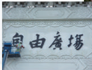
▲ Hanging the "Liberty Square" character castings