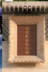
▲ Main plaque at National Taiwan Democracy Memorial Hall