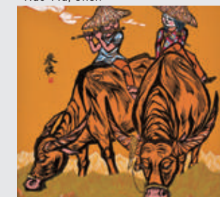
▲ Grazing in Spring/Zhi-Xin, Lin