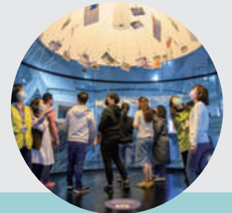
▲ Permanent exhibition on human rights