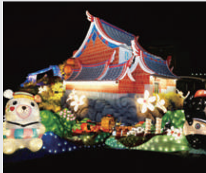
▲ National Day float