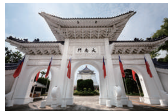
▲ View of the Gate of Great Loyalty/Gin-Hui, Chen