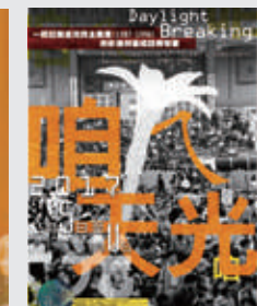
▲ "Daylight Breaking" photography special exhibition