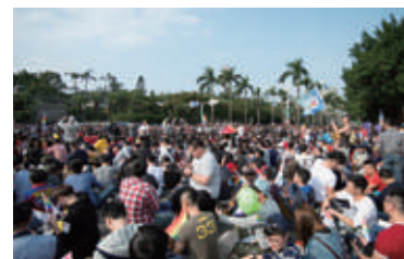
▲ Marriage Equality "Rainbow Event"