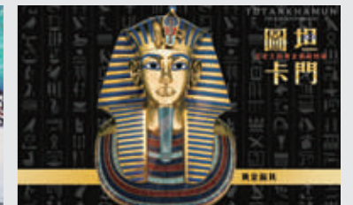
▲ "Tutankhamun-The Golden Pharaoh"