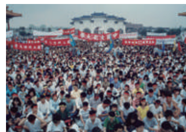
▲ Students and faculty from universities/ senior high schools support the Tiananmen Square protests in 1989