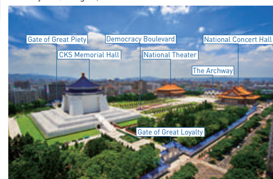
▲ Aerial view of CKSMH