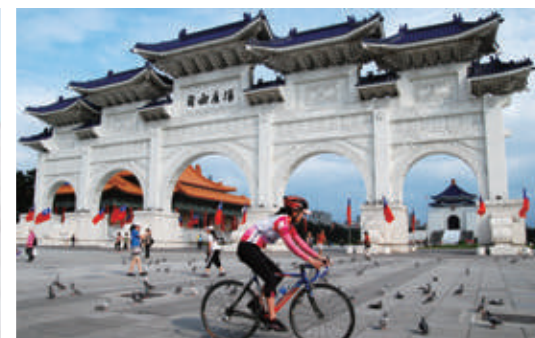
▲ A cyclist/Rong-Ji, Liu