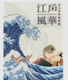
▲ "The History of UKIYO-E"