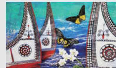
▲ Flying! Lanyu/Wen-Cheng, Lu