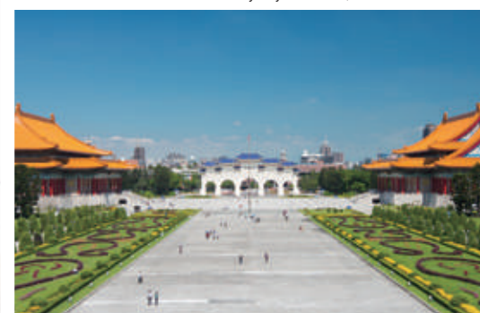
▲ Democracy Boulevard