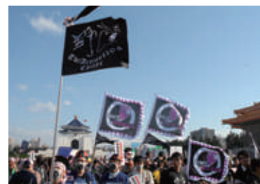
▲ Wild Strawberries Movement in 2008/ Wan-Xing, Qiu