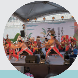
▲ Indigenous artistic performance