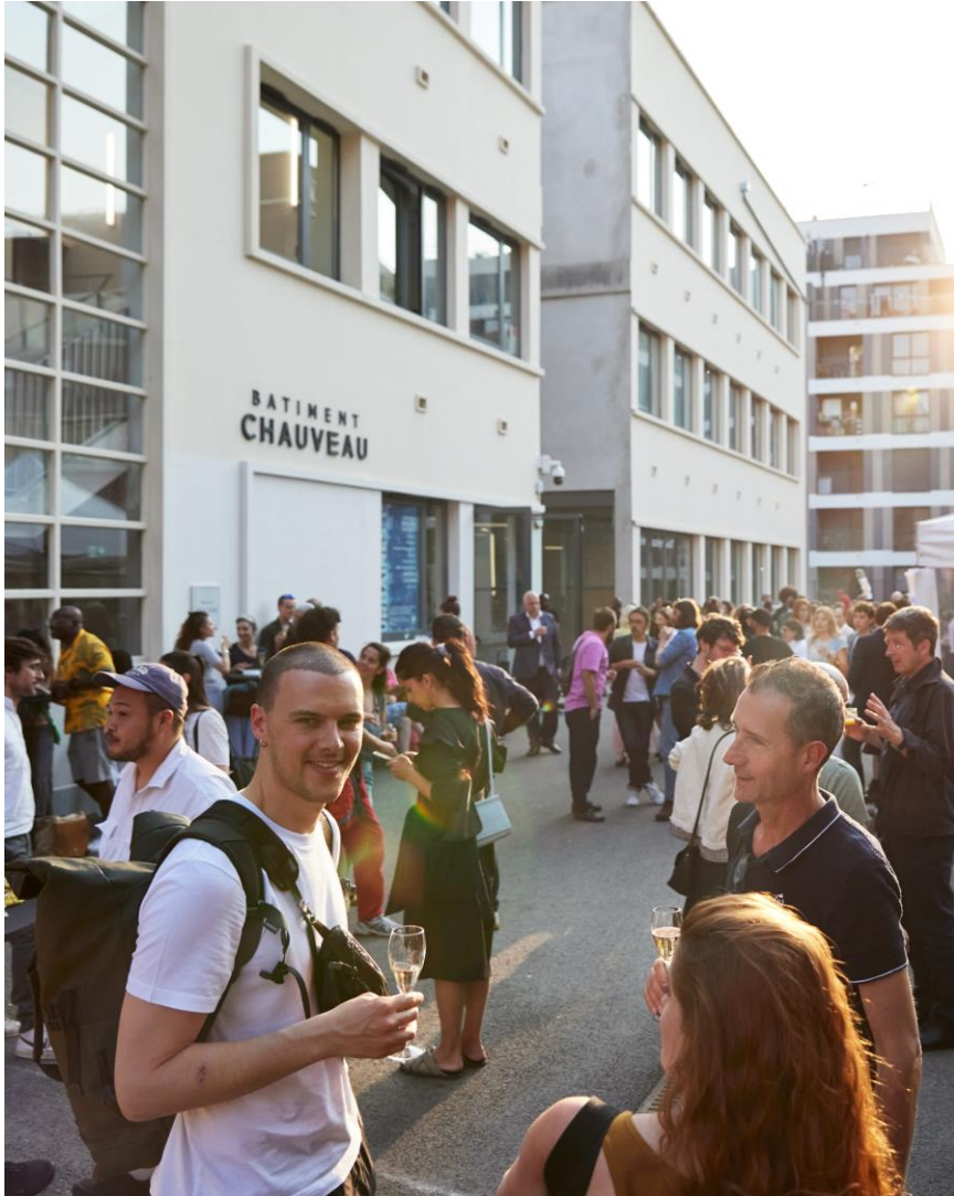
View of the exhibition opening, Gunaikēion 40 ans du Frac, 2023

By relying on the multi-disciplinarity of art forms and research, the Fondation Fiminco also intends to create connections between different art scenes and offer curators in residence the opportunity to situate their work with other creative contexts.