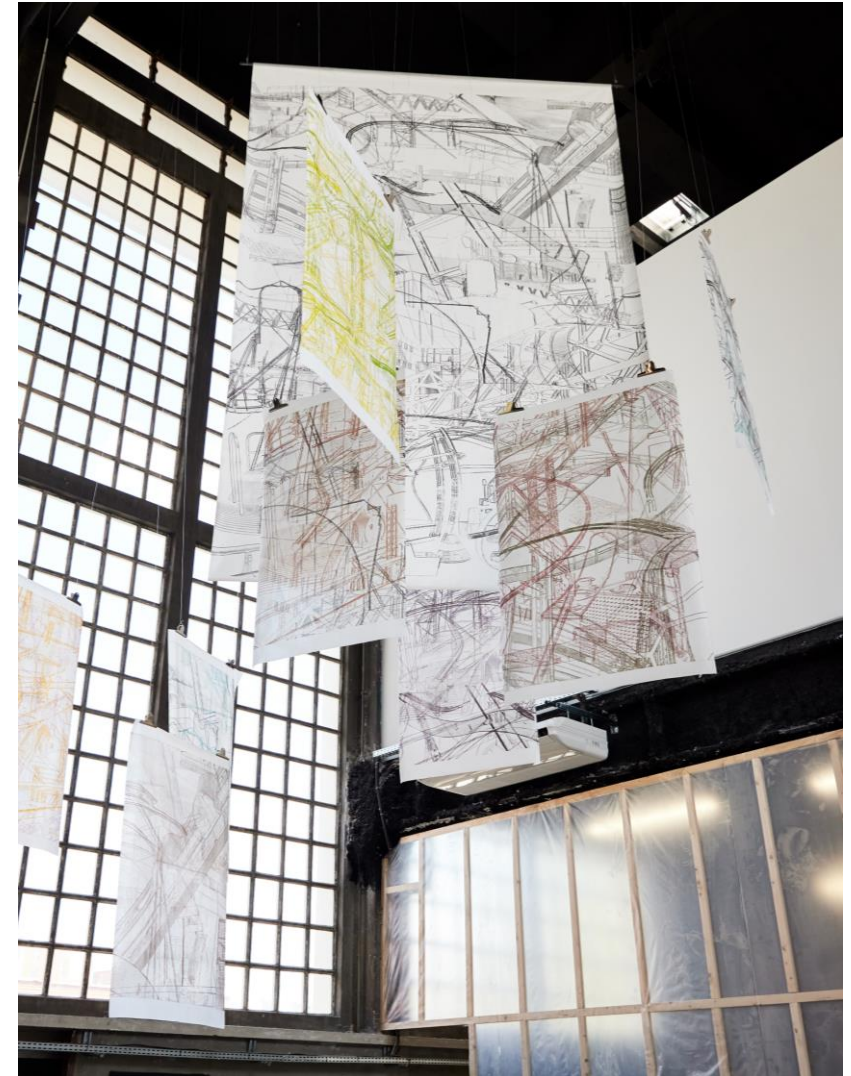
© Andreas B. Krueger, View of the exhibition Odyssees Urbaines , 2023 Artiste - Timo Herbst