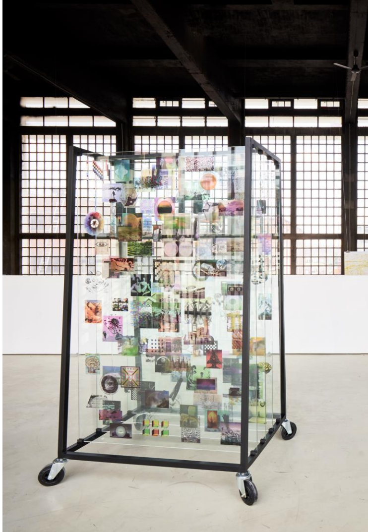
View of the exhibition Odyssees Urbaines , 2023 Artiste - Marielle Chabal