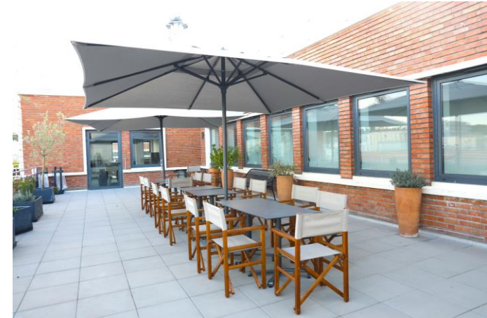
Terrace of the residence

A residency agreement will be signed on the residents' arrival on the premises. The rules of the residency are available on the foundation's website.