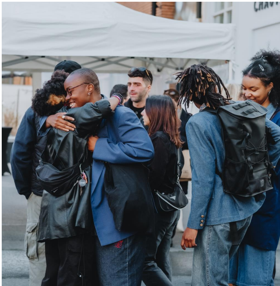
© Manuel Abella, View of the exhibition opening, Gunaikēion 40 ans du Frac, 2023

These events are organized and validated in close collaboration with the Fondation Fiminco team (contextualization, budget, production, communication and mediation). Candidates are required to design and write one or more presentation texts, and to be present at the event.