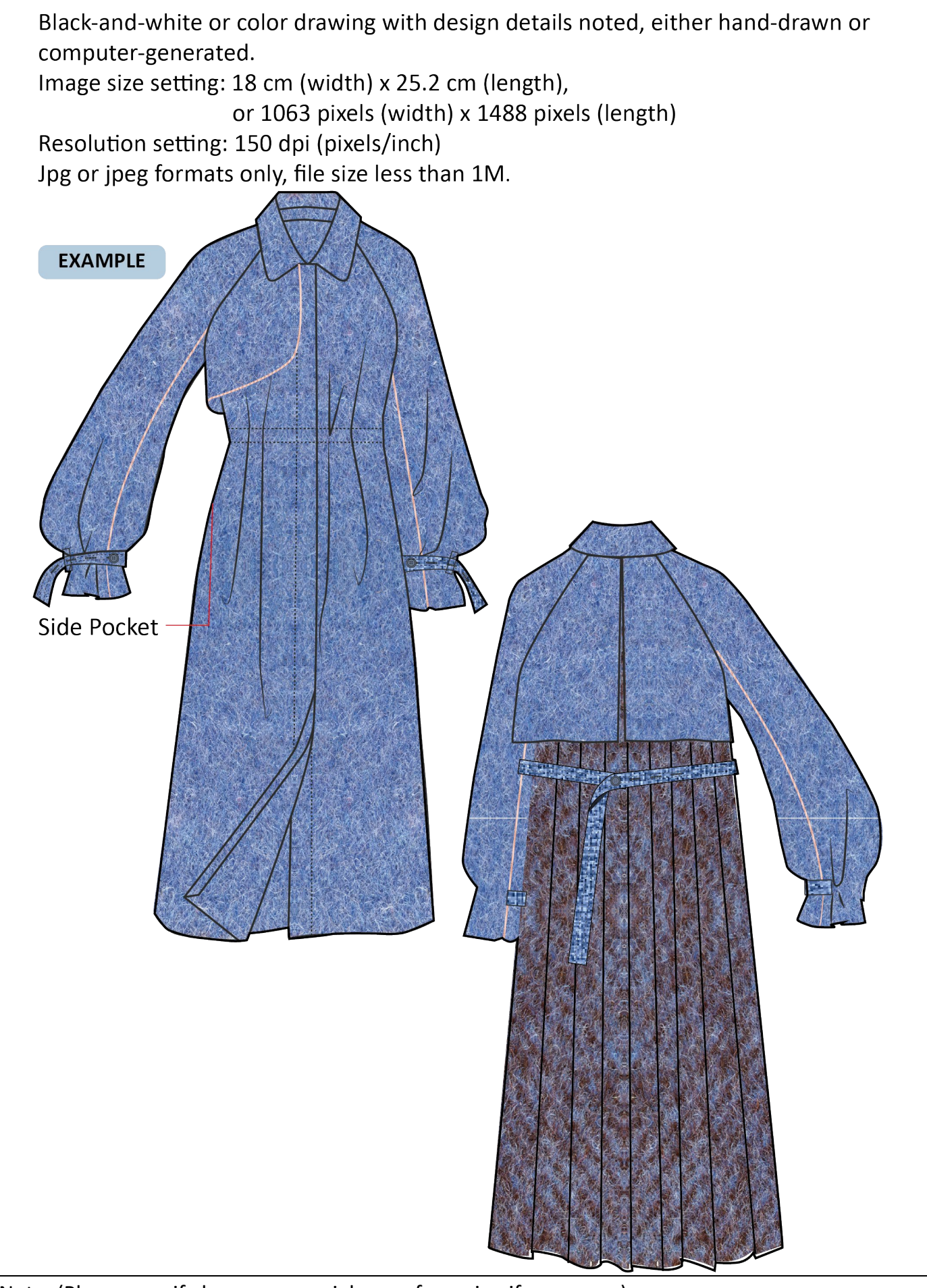
Note: (Please specify here any special way of wearing if necessary)