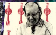
住家阿婆愛作歌 Grandma Lo-Fi