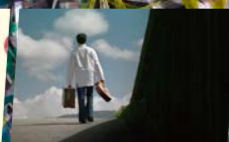
四十年 Ode to Time