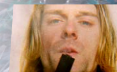
Cobain: 拼貼搖滾 Cobain: Montage of Heck

UA iSQUARE · UA Cine Times · UA Cine Moko