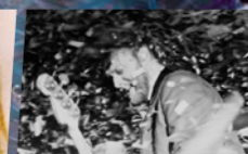
謎之音 Inni (Sigur Rós)