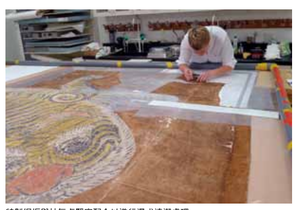
特製網框與抽氣桌緊密配合以進行濕式清潔處理 Specially made screen and suction table underneath aids in wet cleaning.

seen that the backing papers were damaging to the flag, and so the first steps on the conservation path had to include removing the paper backing.