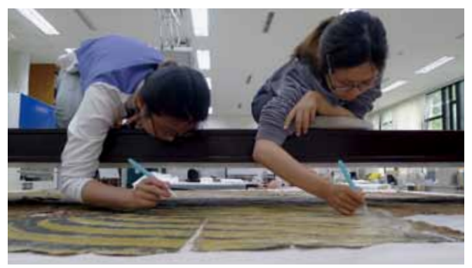
特製的跨橋使得修護師能平穩地接近黃虎旗中央進行工作 Custom made bridge helps conservators safely access the center of the flag

決定委託南藝進行黃虎旗的修護後,修護之途仍有許 多待定奪之處。隨著每一項修護步驟進行,就會發現更多 關於黃虎旗的新資訊,也提供更多的選擇並促使後續的 決定。如此巨幅(長263公分×寬315公分)且複雜的文物, 南藝的修護團隊很快地感受到許多例行性作法變得額外 需要周全考量與準備。例如,光是將旗幟安全地翻面即需 求至少3到6名工作人員。文物攝影檢視則需要特製設備 才能拍攝期至全景,並且需要約8名人力配合。這幅巨型 旗幟在修護期間需要特製暫時性桌面支撐已讓黃虎旗能 攤平;此外,為使修護師能安全地接觸旗幟中央區域,也 必需為其量身訂製一座跨橋;許多所使用的修護工具也 皆需客製化,或者即使是現成的修護工具也需加以改造 來滿足這件大型織品的特殊需求。其中最困難的地方,為 使用抽氣桌進行文物濕式清潔,因為旗幟本身尺寸比抽 氣桌約大12倍,所以每當修護師要接續處理下一個待清