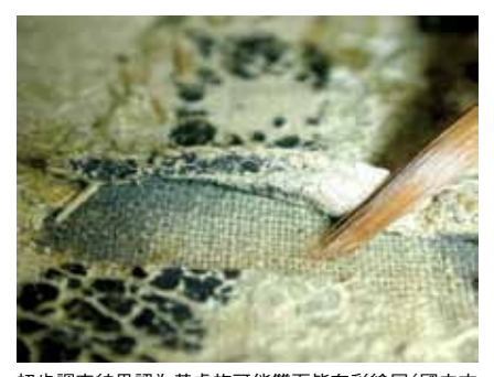
初步調查結果認為黃虎旗可能雙面皆有彩繪層(國立文 化資產保存研究中心籌備處,2007:72) Primary investigation suggested there might be paint layers on both sides.(國立文化資產保存研究中心籌備處,