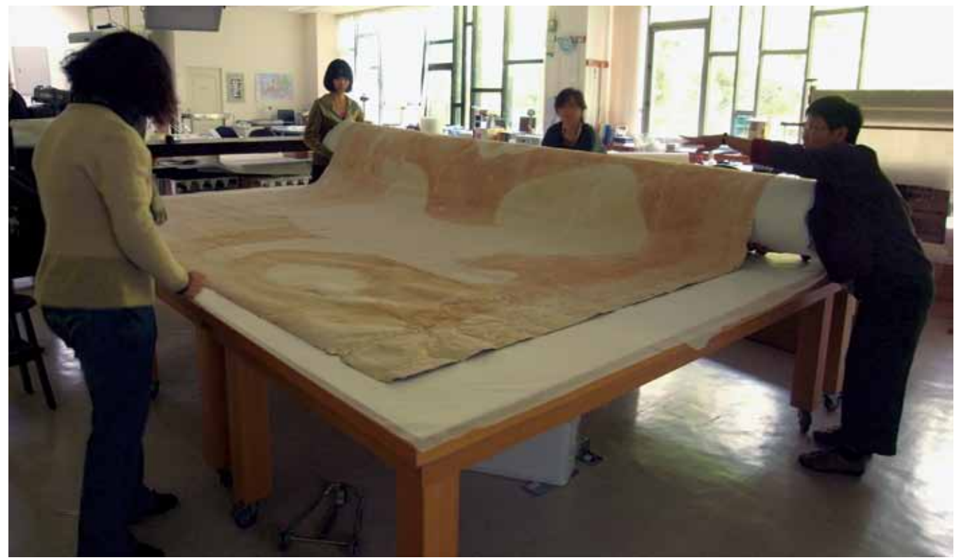
南藝修護團隊在客製化的工作桌上翻動這面大型旗幟 TNNUA conservation team handling the over-sized flag on custom made tables.

黃虎旗的修護處理過程非常耗時,並且,修護顧問也 無法在期間內全程留在南藝。因此評估會議之後,兩位專 家便排定在修護過程的關鍵階段會回到臺南數週,針對 已經執行工作的評估、協助決定接下來的修護程序必並