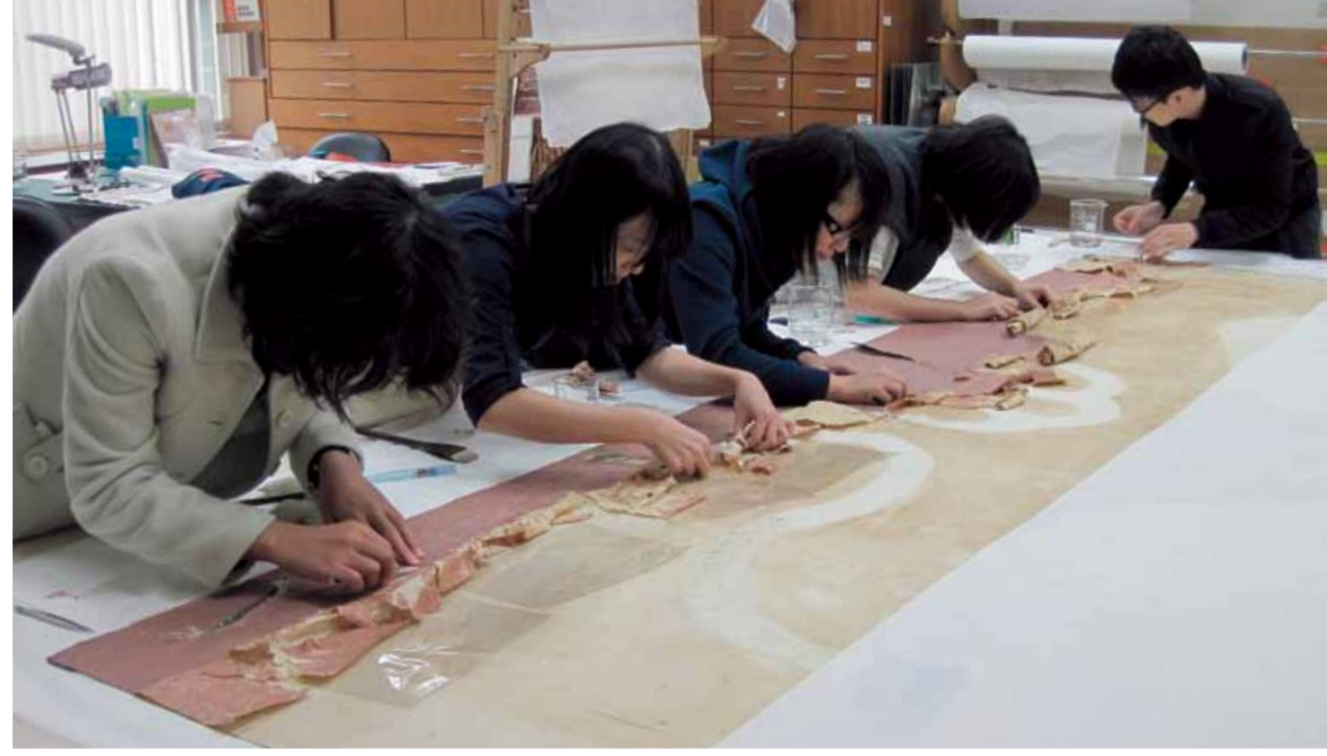
南藝修護團隊扛起這份耗時甚久的修護挑戰 TNNUA team took up the challenges of time-consuming processes

of the Arts (TNNUA), and conservators in Taiwan had the skills to treat the flag, with regular consultation with them and guidance from a textile conservator.