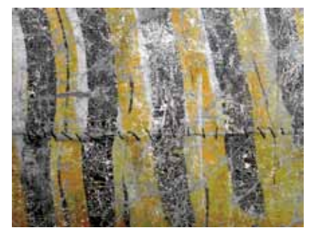
初步調查結果認為藍黑色縫線為為早期修補痕跡(國立 文化資產保存研究中心籌備處,2007:61) Blue threads were thought to be old repairs. (國立文化資產保存研究中心籌備處,2007:61)

aspects of the conservation project, and greatly influenced the chosen conservation path.