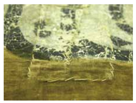
初步調查結果認為米色縫線為早期修補痕跡(國立文化 資產保存研究中心籌備處, Beige threads were thought to be old repairs. (國立文化資產保存研究中心籌備處,2007:61)